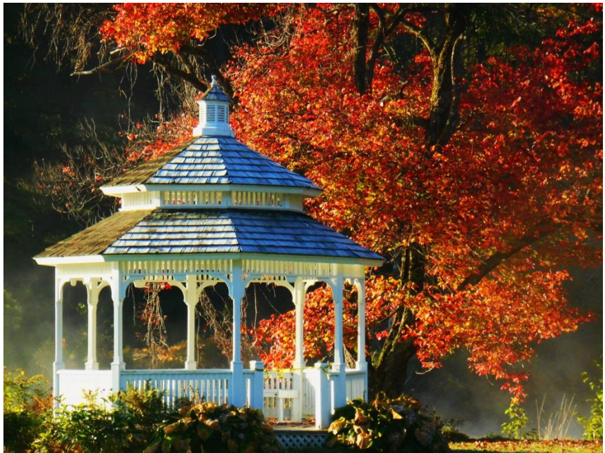
Photograph by: Jennifer Morse 2014